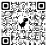
Scan this to fill out our Connect Card Online!

Tear this off and place it in one of the offering boxes by the doors or turn it in to one of our pastors. Thank you!